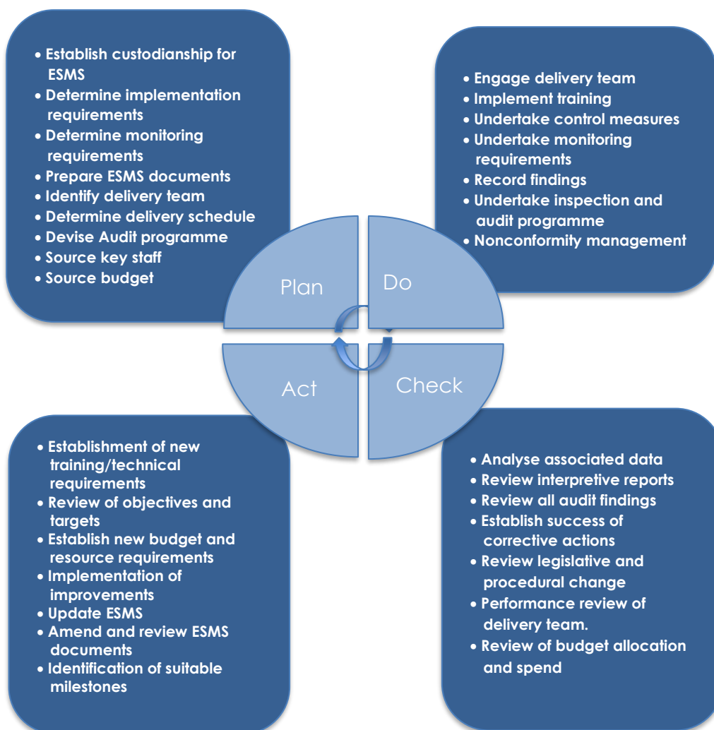
Figure 3-1 Implementation Process

An outline implementation process for ESMS is illustrated in the figure below.